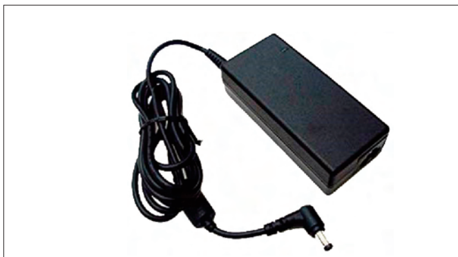
Main power supply adapter (provided in standard): P/N: 978553000