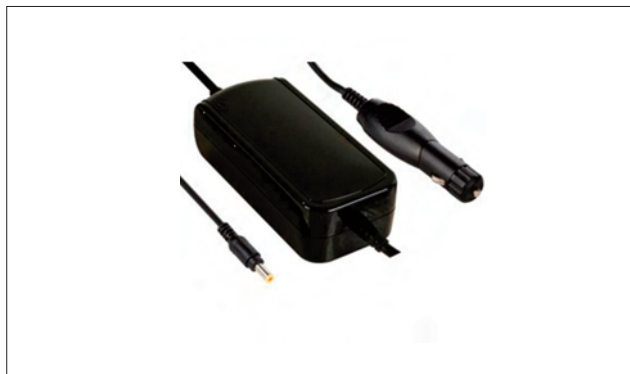
Car cigar lighter adapter: - P/N: 978361000