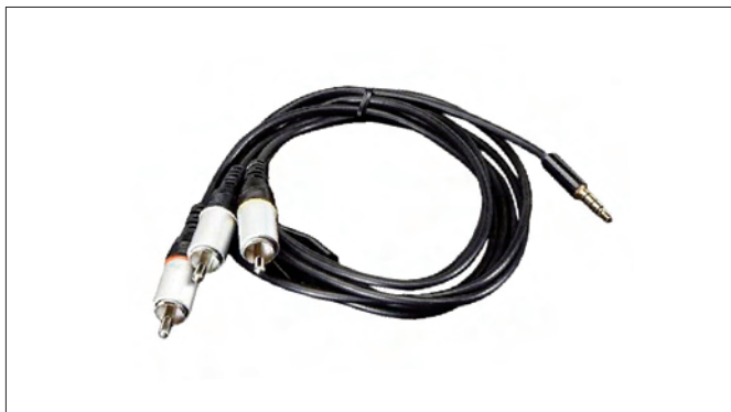
A/V external video cable - P/N: 978853000