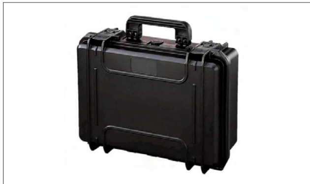
Carrying case - P/N: 978852000