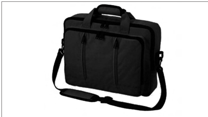
Carrying bag (provided in standard) - P/N: 978851000