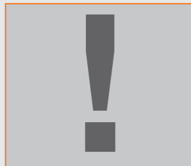
4 Make informed decisions to efficiently manage EZiCAT fleet and operators