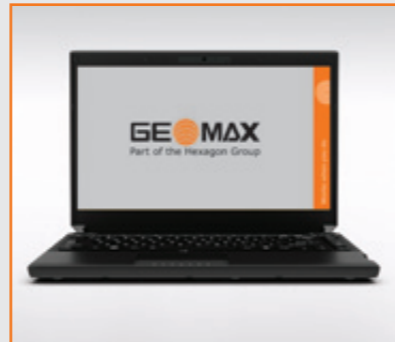
2 Send logged data to Bluetooth® enabled PC