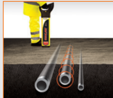
1 Conduct ground survey gathering data

See better results, more comprehensive ground surveys and a reduction in buried service strikes.